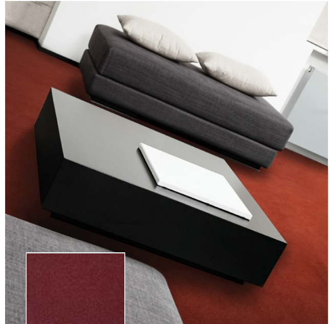
112 / Zen Fusion /